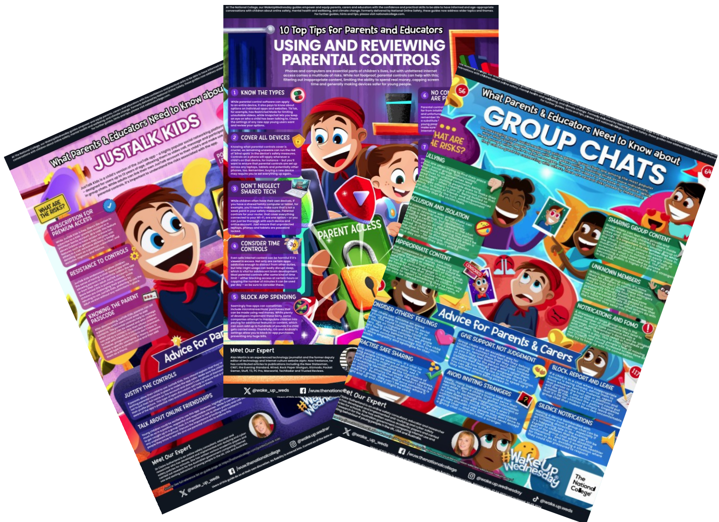
These posters are attached in the ParentMail with this week's Newsletter